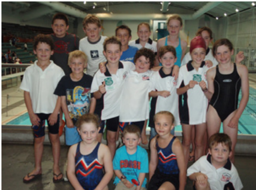
7-10 Encouragement Meet Team 2008